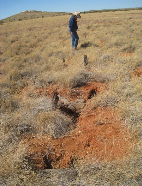
Remains of water trough, Government Well 51, 2013