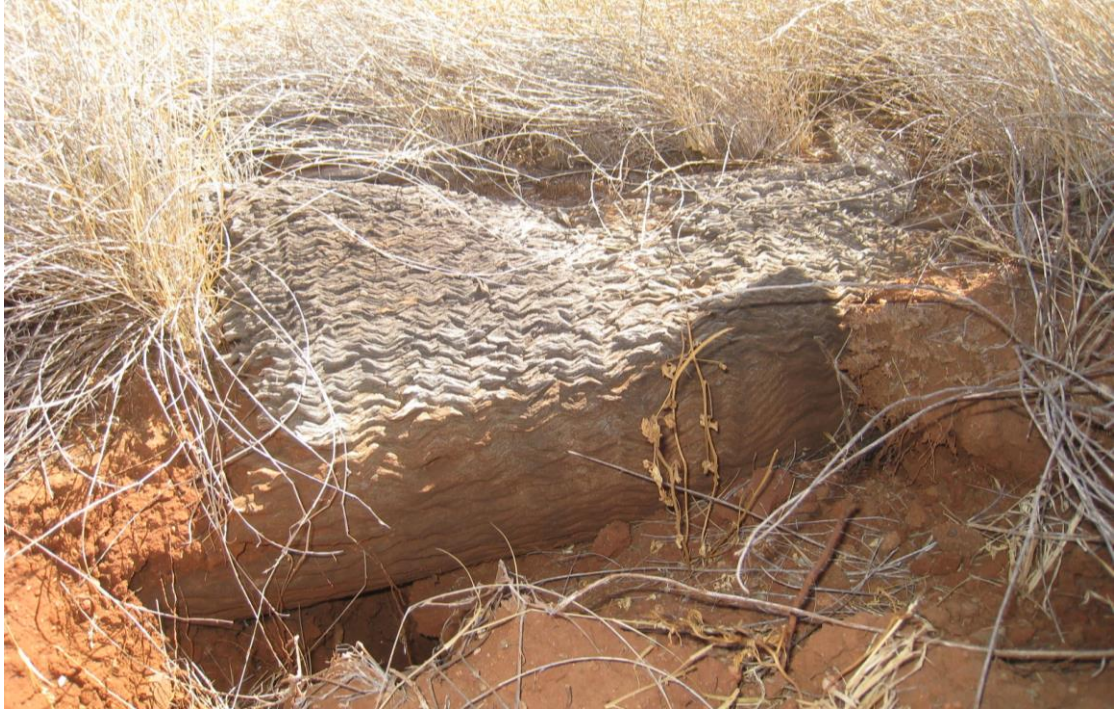
Hand-hewn bush-wood remnant from Government Well 51 water trough, 2013