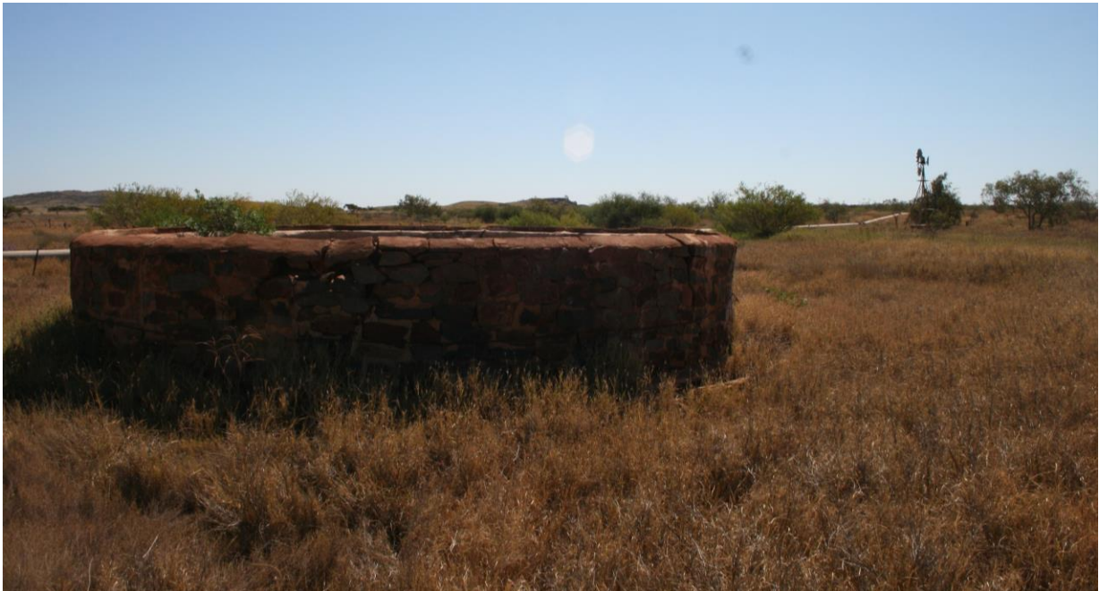
Water tank at Chirrita Station