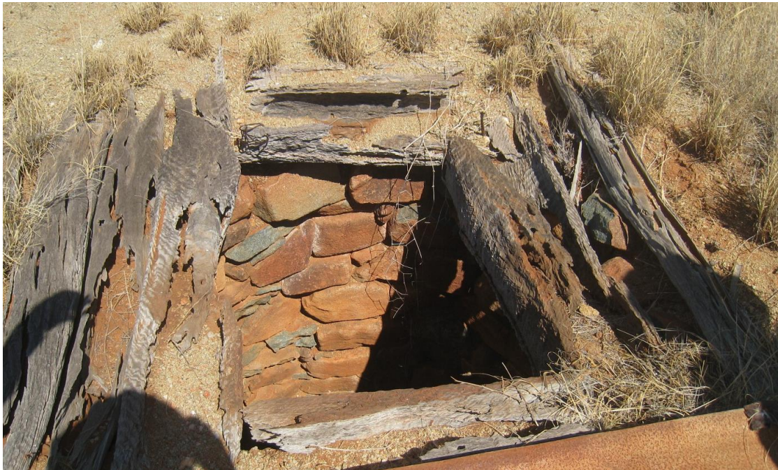
Government Well 51, 2013