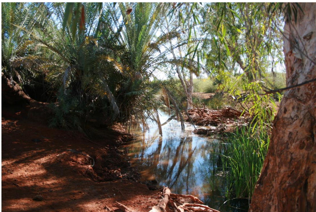
Mardie Pool, location of Hooley Camp 76 on the old stock route