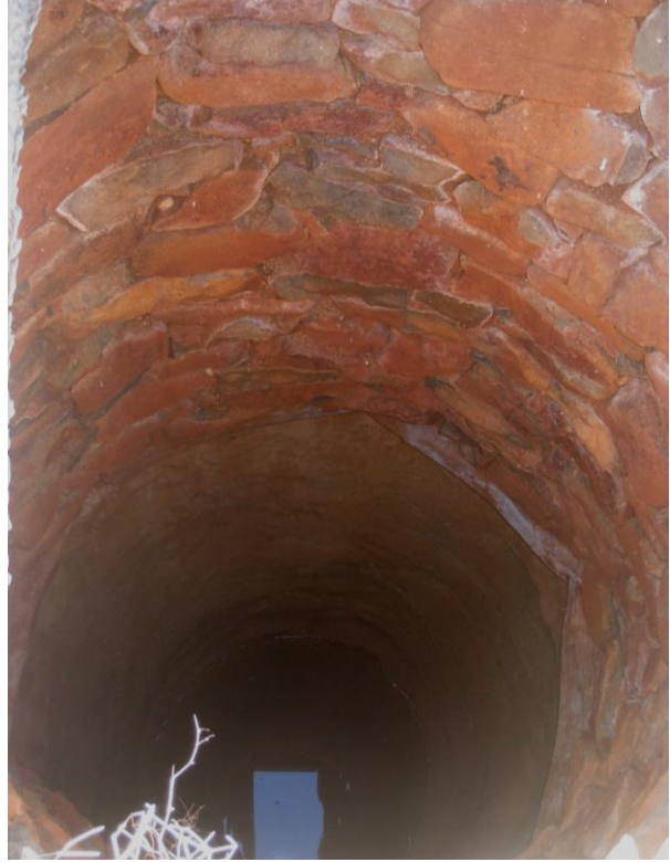
Government Well 51, 2013